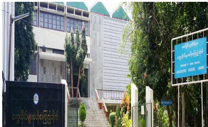
Figure 1: Universities' Central Library

Administration Section, and Theses and Dissertation Section. It is a combined catalog and effort of 23 major University Libraries in Myanmar. 9